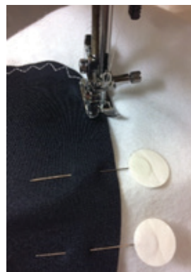
Sew the Pre-Ply in place.