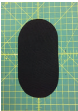
Cut Pre-Ply to desired shape and size.

Rinse out the temporary adhesive. Once you have sewn Pre-Ply into your item, you can activate the GlideWear low-friction effect by washing the fabric. Washing can be done by hand or machine. No soap or detergent is required, however you must make sure all the water-soluble adhesive is washed out. The finished item can then be air or machine dried (tumble dry low).