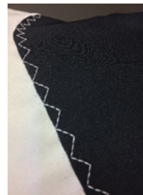
Sew the perimeter before washing!